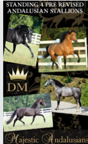
Majestic Andalusians DM

Year two of the Significant Sires Program® is now underway. It is the goal of the management team to surpass last year's numbers. This, of course, will only be possible through participation. Stallion