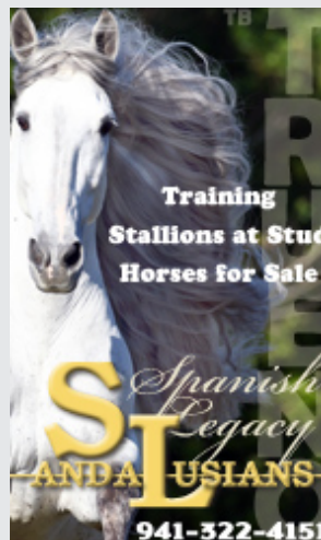
Spanish Legacy Andalusians