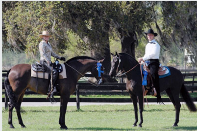
Lucea BR & Lupita Mia